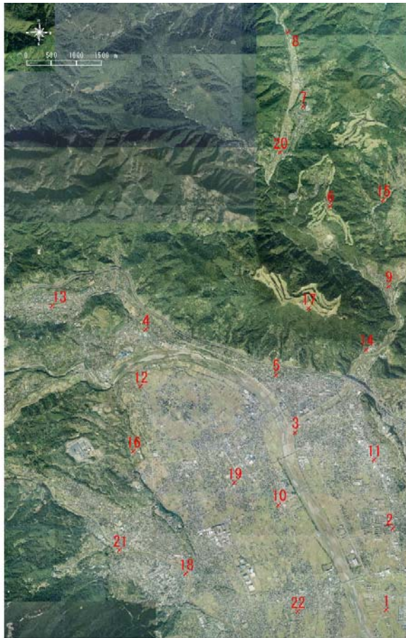
Figure 1. Distribution of GCPs in the test field

effect of systematic errors. The distribution of GCPs in the test field is shown in figure 1.