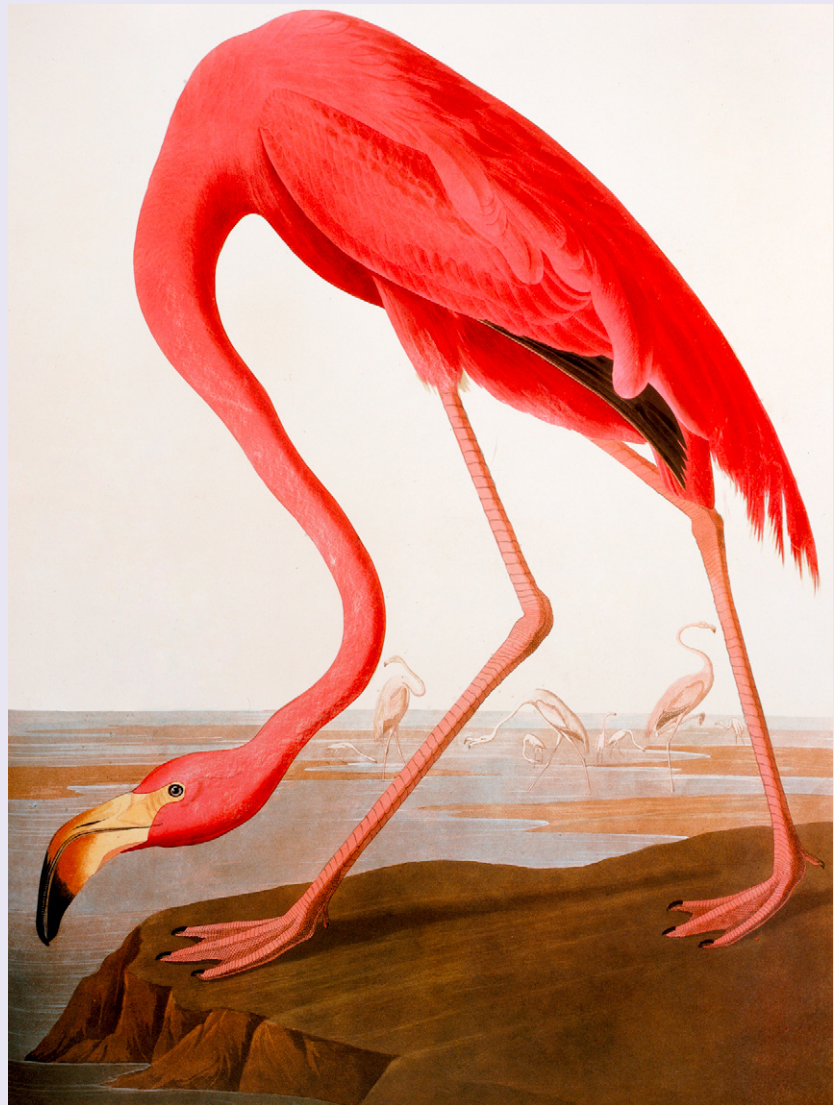
Famous: Some of Audubon's illustrations of American birds are the most highly prized in the country.

Audubon was not only a skilled artist but also a talented salesman.