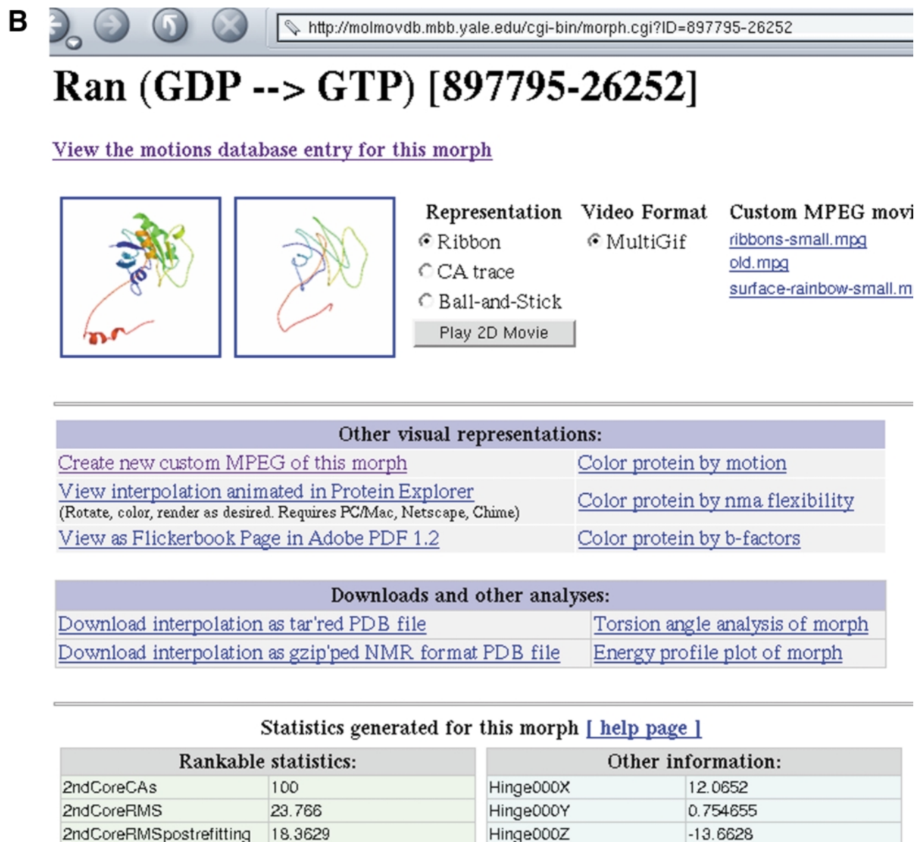
Figure 1. (Previous page and above) (A) Schema of the database, showing flow of information and relationship between motions and morphs. The ideal morph for each motion, where available, is shown with bold highlighting. (B) Page describing an individual morph. At the top is a listing of movies and images associated with the morph, followed by more elaborate representations. Complete trajectories are available for download either as a collection of files or as a single PDB file with multiple MODEL records. A comprehensive listing of statistics generated by the server appears below, along with the sequence alignment used as reference when generating the morph (not shown).