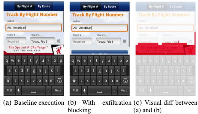
Figure 3: Detecting side effects using visual diff: The red shaded region in (c) highlights the advertising banner missing from (b).

Detecting whether side effects impact user -desired functionality is a determination that eventually requires consultation of a user. However, placing a human in the loop can introduce bias and slow the process down, running counter to our goal of systematic, automated testing. To reduce the scalability constraints and bias caused by human evaluation, we leverage the insight that side effects are likely easy to detect and confirm if the visual outputs of the baseline and experimental executions can be compared side by side. We employed a feature of the GUI testing system to capture a screenshot from the Android device after every command in the test script. We first ran each test script with our baseline configuration—no resources were replaced with shadow resources and no attempts to exfiltrate data were blocked. We then ran each test script with our experimental configurations, in which either data shadowing or exfiltration blocking was activated. For each experimental execution, we automatically generated a web page with side-by-side screenshots from the baseline execution and the experimental execution, along with a visual diff of the two images. We found that these outputs could be scanned quickly and reliably, with little ambiguity as to whether a side effect had been captured in the image logs, as shown in Figure 3.