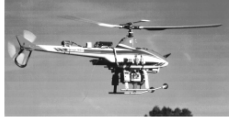
Fig. 1. The CMU Yamaha R50 helicopter in autonomous flight.

where \mathcal{M} denotes the discrete class of models to be estimated from the data. The second distribution in each summation is just the posterior model M' ; that is, the distribution over Markov models conditioned on the observed data and the transition from X_0 to X_1 . But then the final equation shows that p(X_2, X_1 | X_0, \mathcal{T}) is just another one-step distribution from the new distribution of models P(M') , simply the learned model under the old data and the new observed transition.