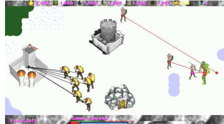
Figure 1: Freecraft strategic domain with 9 peasants, a barrack, a castle, a forest, a gold mine, 3 footmen, and an enemy, executing the generalized policy computed by our algorithm.

The idea of generalization has been a longstanding goal in Markov Decision Process (MDP) and reinforcement learning