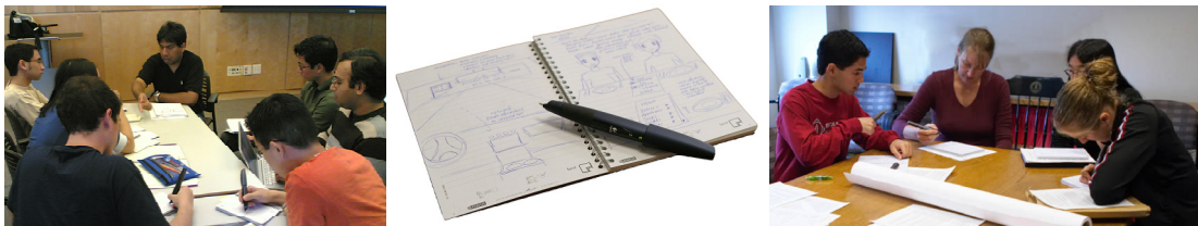
Figure 1. Students during group meetings using the Ideas ecology; the Ideas digital pen and notebook.

This paper begins by summarizing the implementation framework of the Ideas learning ecology, for which Idea Logs are the starting point, barriers to adoption of such an augmented paper system, and usage and performance metrics. We concentrate on the effects of group dynamics on the appropriation (Pea, 1992; Leontiev, 1981) and usage of the system, as well as the students' enjoyment and performance in the course. Hardware and software can provide incentives and barriers to collaboration, yet our findings indicate that group dynamics may have as powerful an effect—if not more—on both adoption of the collaborative tools and on performance metrics. We find that the type of content and frequency of writing in their Idea Logs, both paper and electronic, correspond with the team's dynamics.